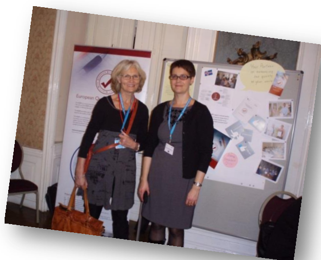
Members from Norway and Iceland promoting the EQM in Vienna, November 2013