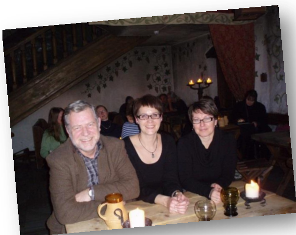
Members from Lithuania, Iceland and Estonia promoting the EQM in Tallinn, December 2012